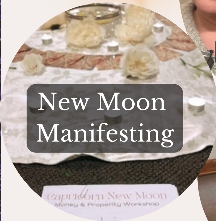
New Moon Manifesting