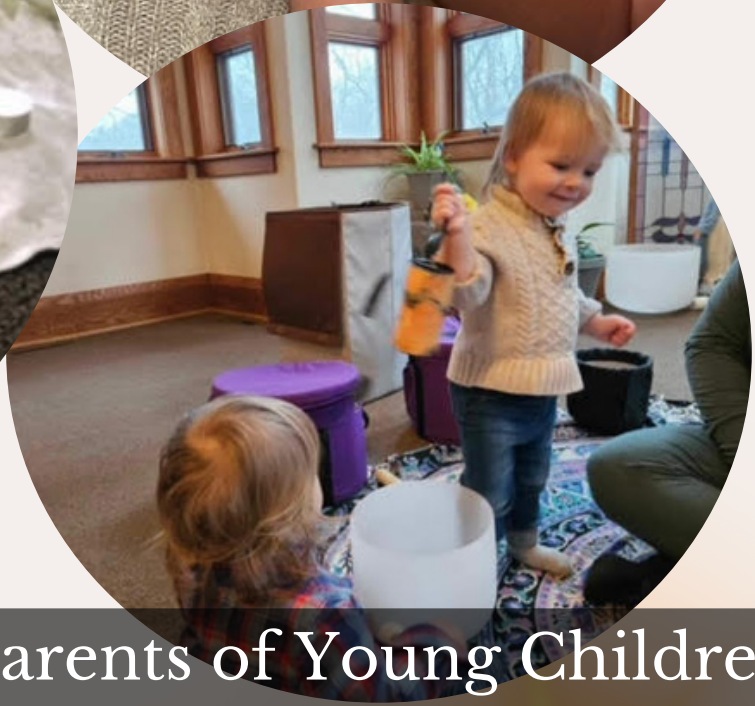
Parents of Young Children Support Group